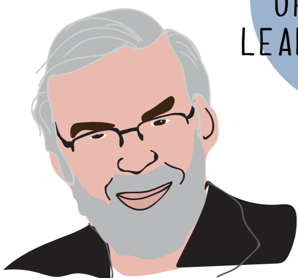
TOM ARNOLD INSTITUTE OF INTERNATIONAL AND EUROPEAN AFFAIRS